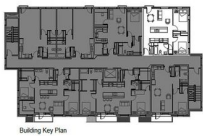
Building Key Plan